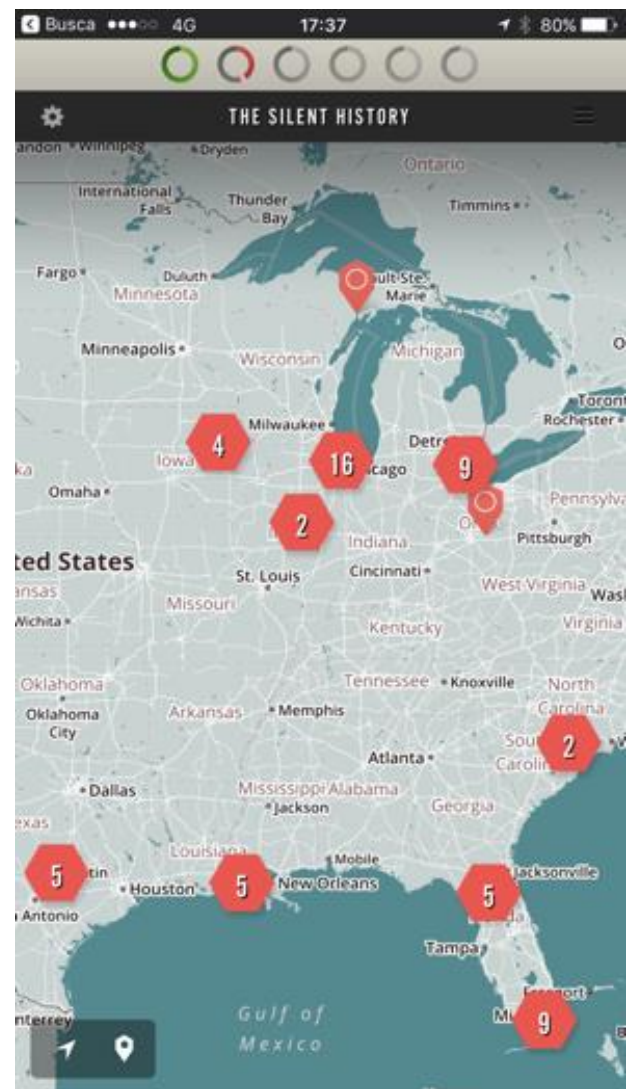
Figure 2: Field reports on the application book The Silent