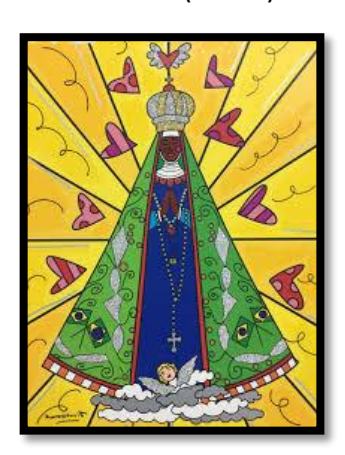
FIG. 4 FIG. 5

Before this anniversary, the context of Catholic culture always favored the media process. Two examples of how this type of industry acts directly in the mass were the soap opera A padroeira <sup>17</sup> and the movie Aparecida: the miracle <sup>18</sup>, both based on the story of Our Lady of Aparecida. We are also reminded here of works by Patriota (2009) where she identifies that a "religious revival" <sup>19</sup>, (2009, p.183, our translation) that occurred mainly from the 1990s onwards, was constructed by means of a media that