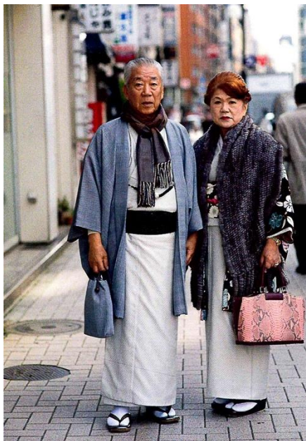
Figure 4 – Without identification, Advanced Love (COHEN, 2018, p.215)